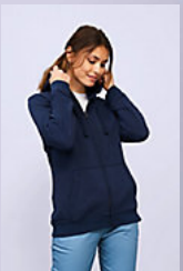
SOL'S SPIKE WOMEN 03106