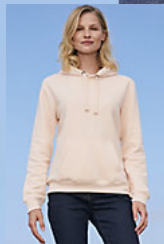
SOL'S SPENCER WOMEN 03103