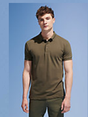
SOL'S PRIME MEN 00571