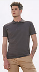
SOL'S PRESCOTT MEN 11377