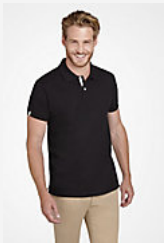
SOL'S PORTLAND MEN 00574