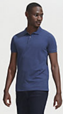
SOL'S PHOENIX MEN 01708