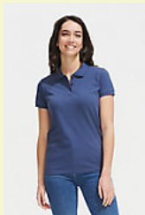
SOL'S PERFECT WOMEN 11347