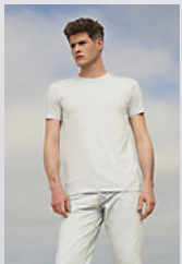
SOL'S MARTIN MEN 02855