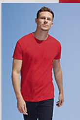
SOL'S Imperial 11500