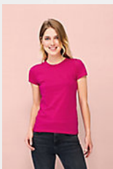
SOL'S MISS 11386